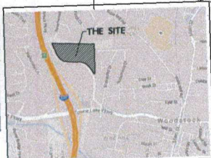
LOCATION MAP NTS.