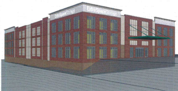
3 Corner of Hwy 92 & S Cherokee Ln