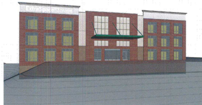
4 South Cherokee Ln View