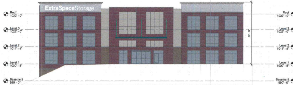
2 West 3/32" = 1'-0"